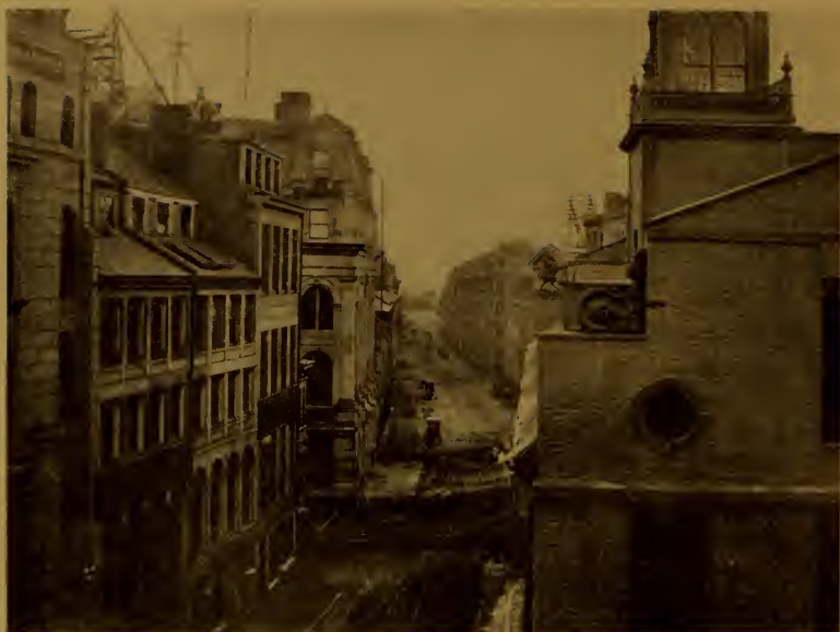
View looking down State Street in 1880